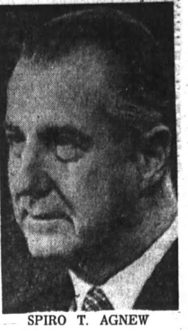
SPIRO T. AGNEW

There isn't any basis for feeling that my trip is related to theirs," Agnew said, adding, "I had no knowledge that Secretary Laird was going to make this trip."