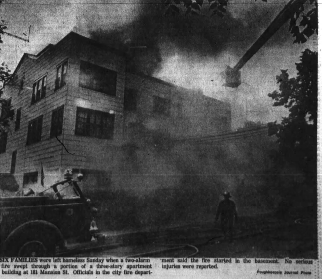
SIX FAMILIES were left homeless Sunday when a two-alarm fire swept through a portion of a three-story apartment building at 181 Mansion St. Officials in the city fire department said the fire started in the basement. No serious injuries were reported.

conduct after she attempted to enter the smoke-filled building to rescue two dogs.